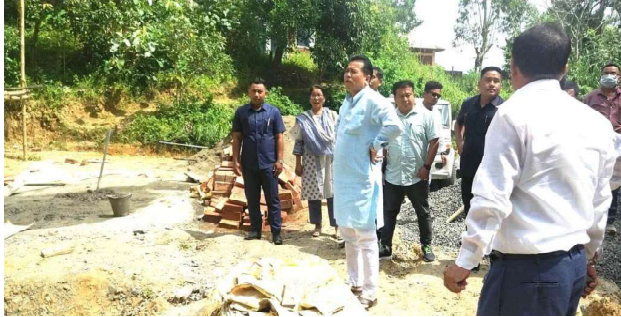
IT News Imphal, Sept 1:

Agriculture Minister Thongam Biswajit today said that the Agriculture department is trying all effort to ensure that all farmers in the state got fertilizers on time. He said that there is complete transparency to the distribution of fertilizers to all the districts of the state.