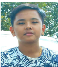
By: Schindler Potsangbam

It's true when someone says that we should be grateful for all the little things, but nevertheless, nowadays we are seeing that people are not showing much gratitude.