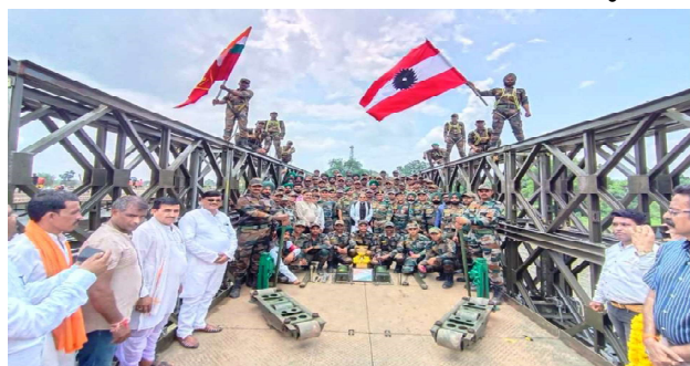
The handing over ceremony of Bailey Bridge over Sukhtawa River in Madhya Pradesh.

The completion of this bridge has been a perfect example of a seamless and synergized civil-military response to national emergencies.